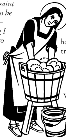
SAINT THERESA of Lisieux

To be a saint means to be myself—everything I am meant to be.