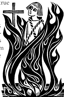
SAINT JOAN OF ARC

In fact, awareness of yourself and a true understanding of your role in life is the first step on the road to holiness. Thomas Merton, the Trappist monk and well-known writer, once observed, "For me to be a saint means to be myself. Therefore the problem of sanctity and salvation is in fact the problem of finding out who I am and of discovering my true self... God leaves us free to be whatever we like. We can be ourselves or not, as we please. But the problem is this: since God alone possesses the secret of my identity, he alone can make me who I am or rather, he alone can make me who I will be when I at